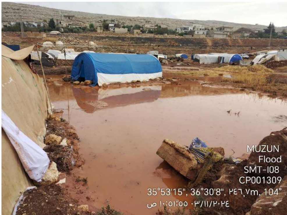
Flood Incident in Eudwan IDP Site 1

According to the latest Funding Tracking Analysis, CCCM Sector partners have secured only 12% of the required budget to respond to the 2025–2026 winter needs in IDP sites. The Sector’s response will prioritize two key areas: