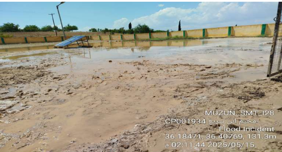
Flood Incident in Ibn Sariaa IDP Site 2